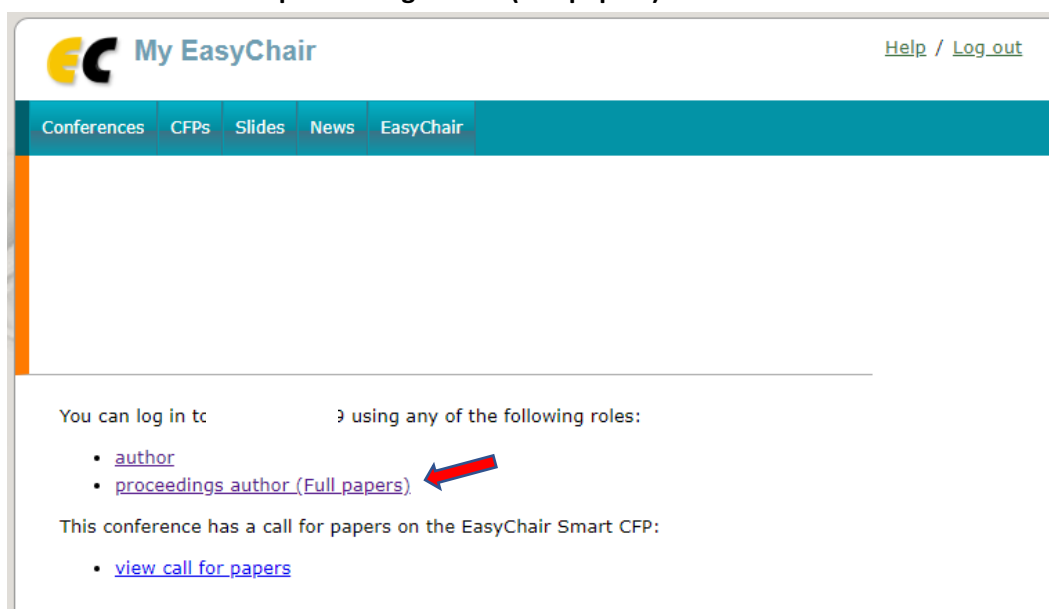
Figure 1: Changing your role proceedings author (Full papers)