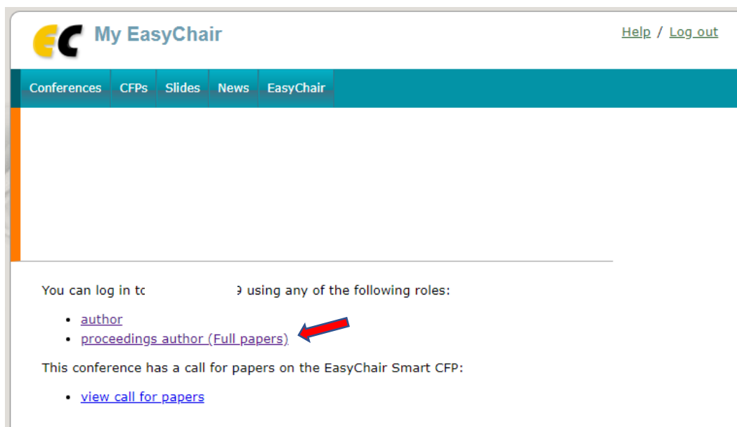
Figure 1: Changing your role proceedings author (Full papers)